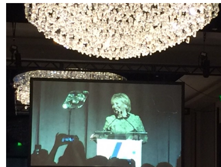
Clinton speaks at Annie's List event